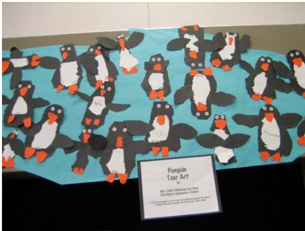
Los Gatos Student Art Show art work

Funded in part by LGEF, LGUSD, H&S Clubs, Town of Los Gatos, & Members of the Community