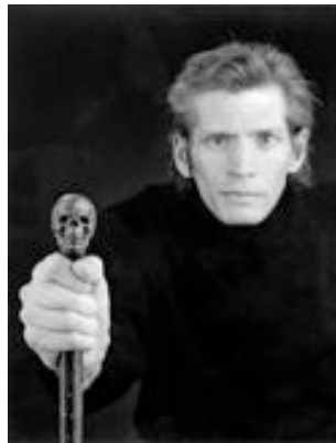
Robert Mapplethorpe: Portraits January 29, 2011 through June 5, 2011