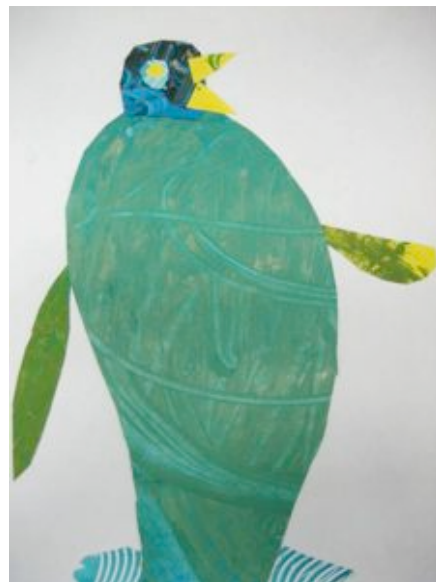
Student Art Work from the Art Show