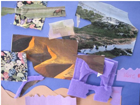
Romare Bearden Collage