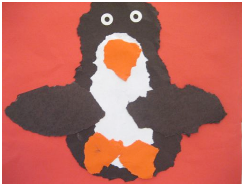
Los Gatos Student Art Work

Funded in part by LGEF, LGUSD, H&S Clubs, Town of Los Gatos, & Members of the Community