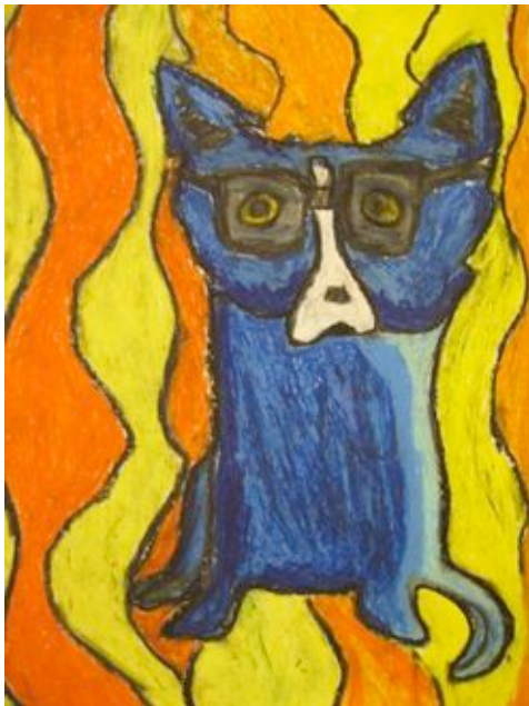
Los Gatos student art

Funded in part by LGEF, LGUSD, H&S Clubs, Town of Los Gatos, & Members of the Community